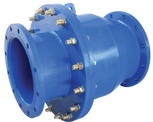
SERIES - NSCV 01 Non Slam Check Valve