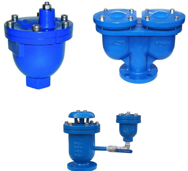
Series ARV 01 Air Valve