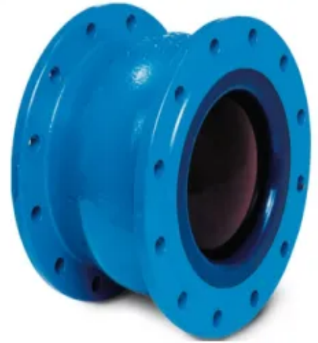
SERIES - AXC V 01 Axial Nozzle Check Valve