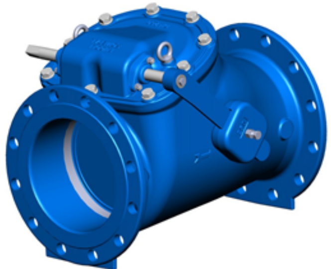
SERIES - SCV 01 - Swing Check Valve