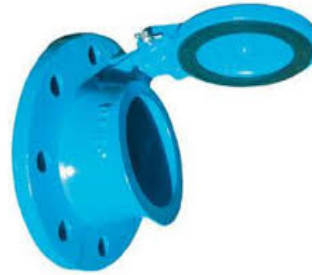
Series FLP 01 Flap Valve