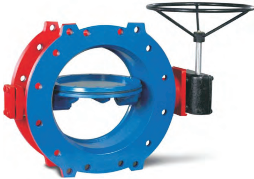
Series 7500 Double Eccentric Butterfly Valve