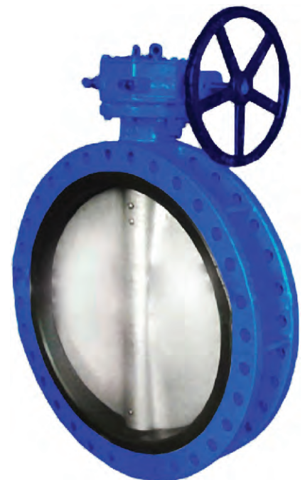
Series 7200 Resilient Seated Butterfly Valve