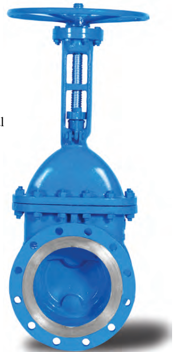
SERIES - GTV-W- 01 Gate Valve